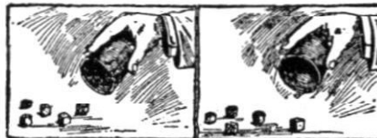
Our Flop, "FIVE ACES" | Opponent's "A STRAIGHT"

Transparent First Flop Dice and Combination Poker Dice, a different hand every throw, made in 9-16 or \frac{1}{2} inch transparent celluloid any shade, including box and directions. Price per set of 5, $4.00