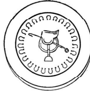
Saddle No. 64 Per 1,000 $12.

Guaranteed to stack Perfect, and to be unbreakable. Par- ticularly adapted for Poker, Craps, &c.