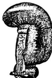
No. 63A No. 63B

No. 64A. Corbett pattern. Made of wine color back, green palm and cuff, improved palm grip, laced and padded wrist, stuffed with a good quality curled hair. Per set.....$3.00