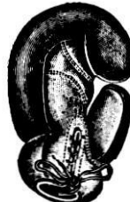
No. 66A No. 67A